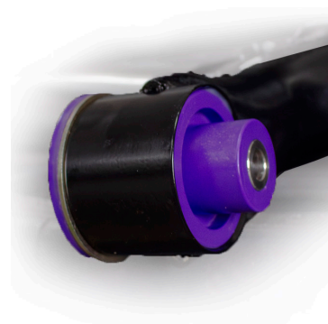
Figure 2 - Fitted