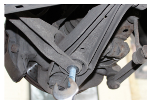
Remove the outer bush bolt securing control arm link to arm