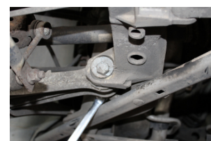
Remove the inner bush bolt