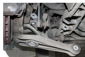
Drop the arm down to access the Ball joint